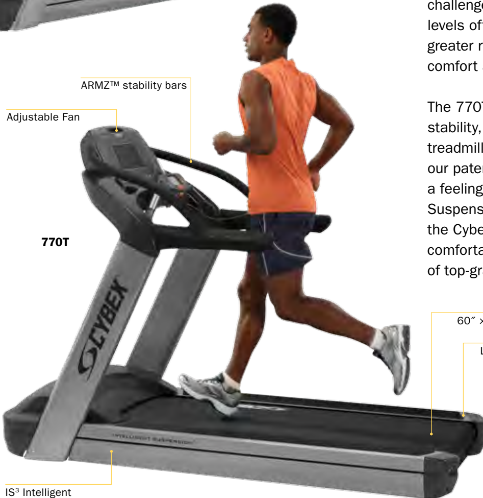
ARMZ™ stability bars