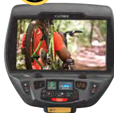
E3 View Optional display. See page 30 for details.